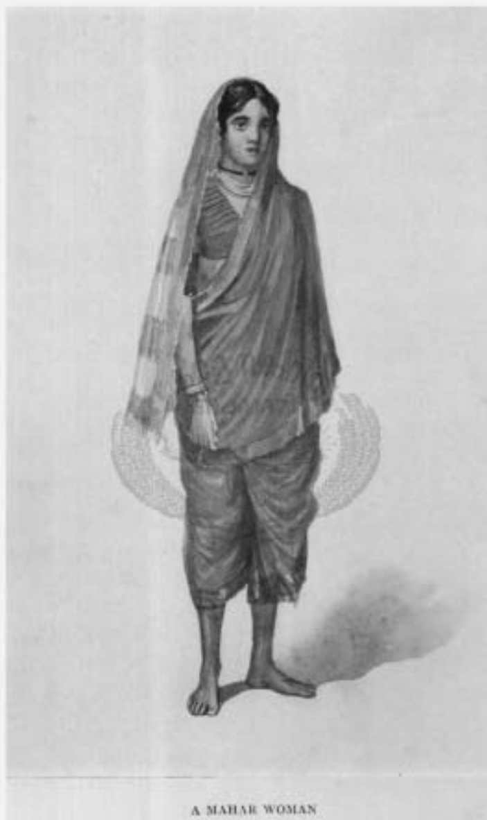
A MAHAR WOMAN